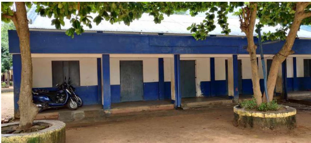
Outside the prayer hall