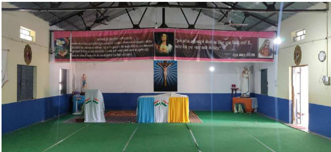
Inside the prayer hall